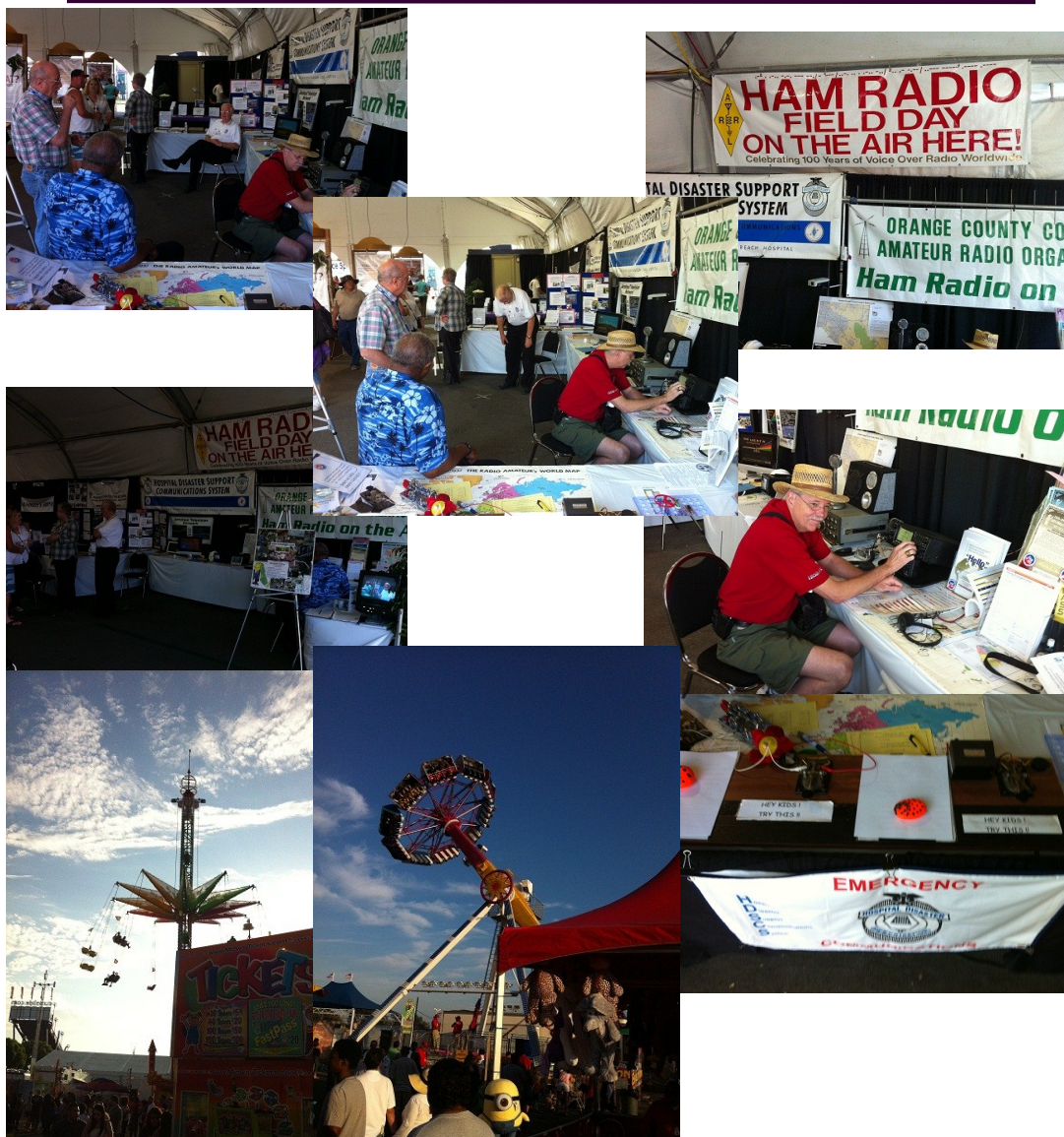
Orange County Fair - June 2011