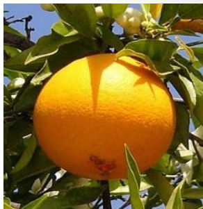
The Juiciest Section