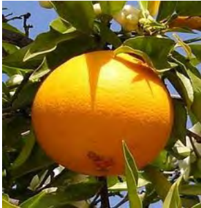
The Juiciest Section