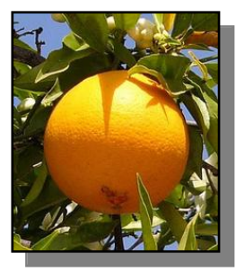
The Juiciest Section