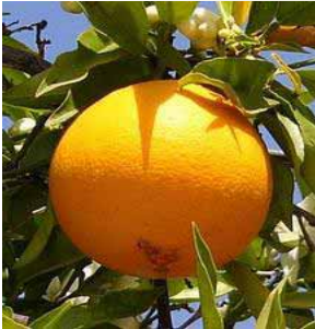
The Juiciest Section